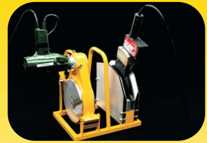
HEATING PLATE / TRIMMER