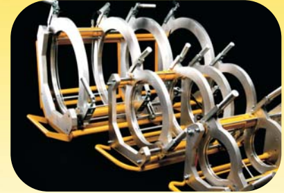
SIZE RANGE FROM DN160 UP TO DN1200